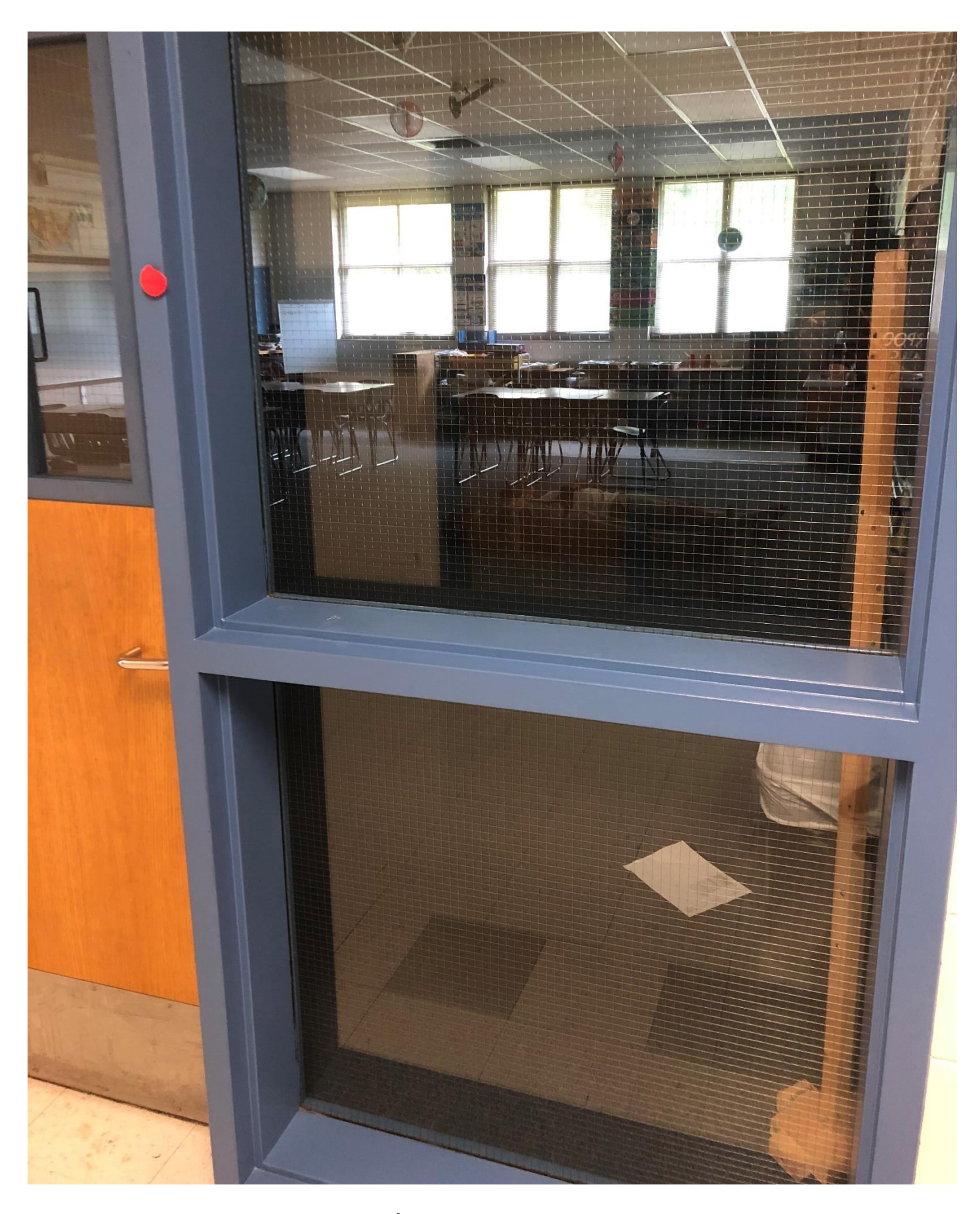
This is how the alleged crime scene/molestation event would have appeared to someone approaching the classroom door from the outside. (Note the two people laying down inside.)